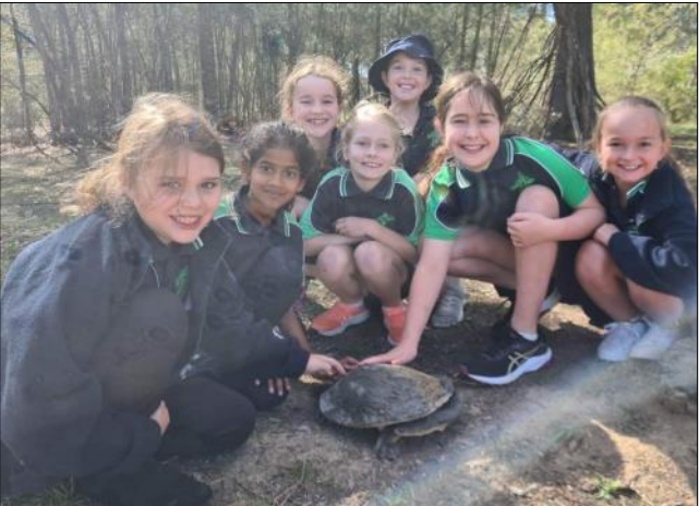
We had a visitor in the yard at recess today!