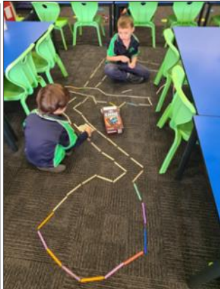
We had fun making pictures using 100 icy-pole sticks.